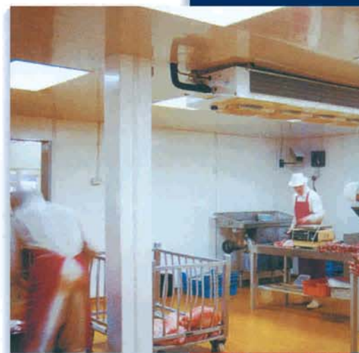
Food Processing Plant