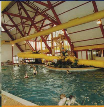
STRIPCLAD / STURDYCLAD