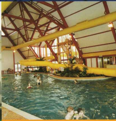
STRIPCLAD / STURDYCLAD